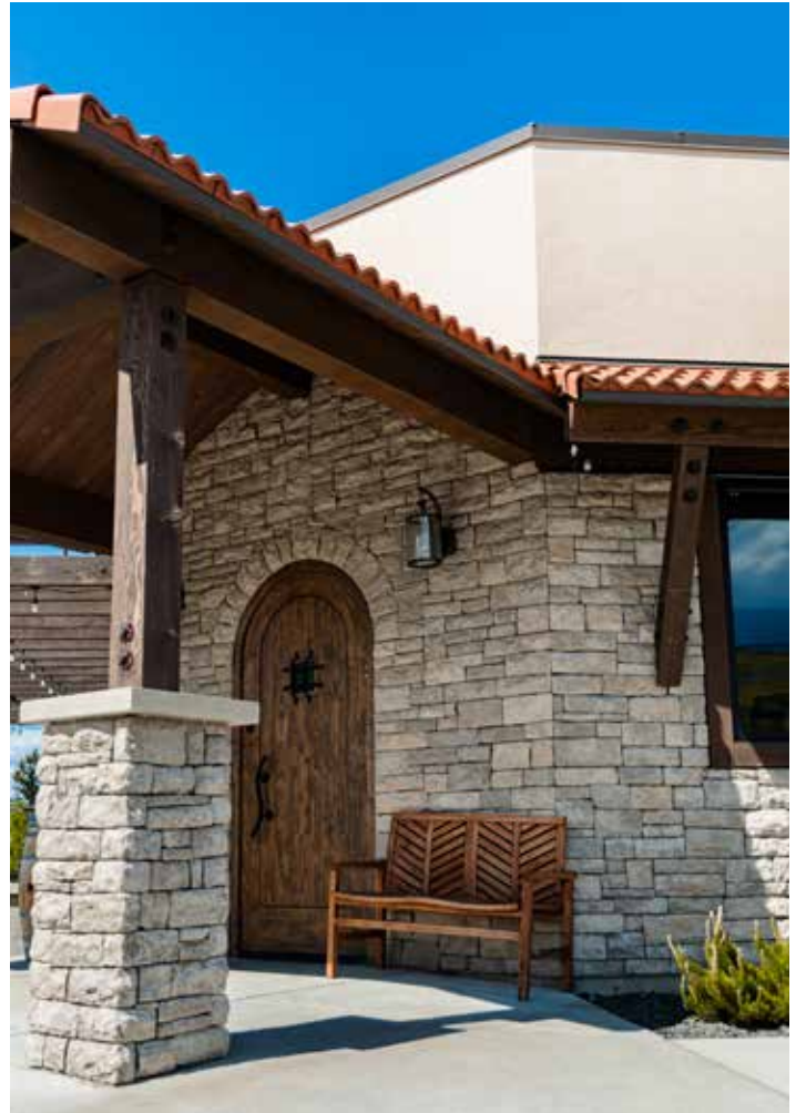
Chiseled Limestone - Sahara

*Square footage is based on an installation with 1/2" grout lines.