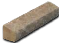
Sill ~ 17-7/8"