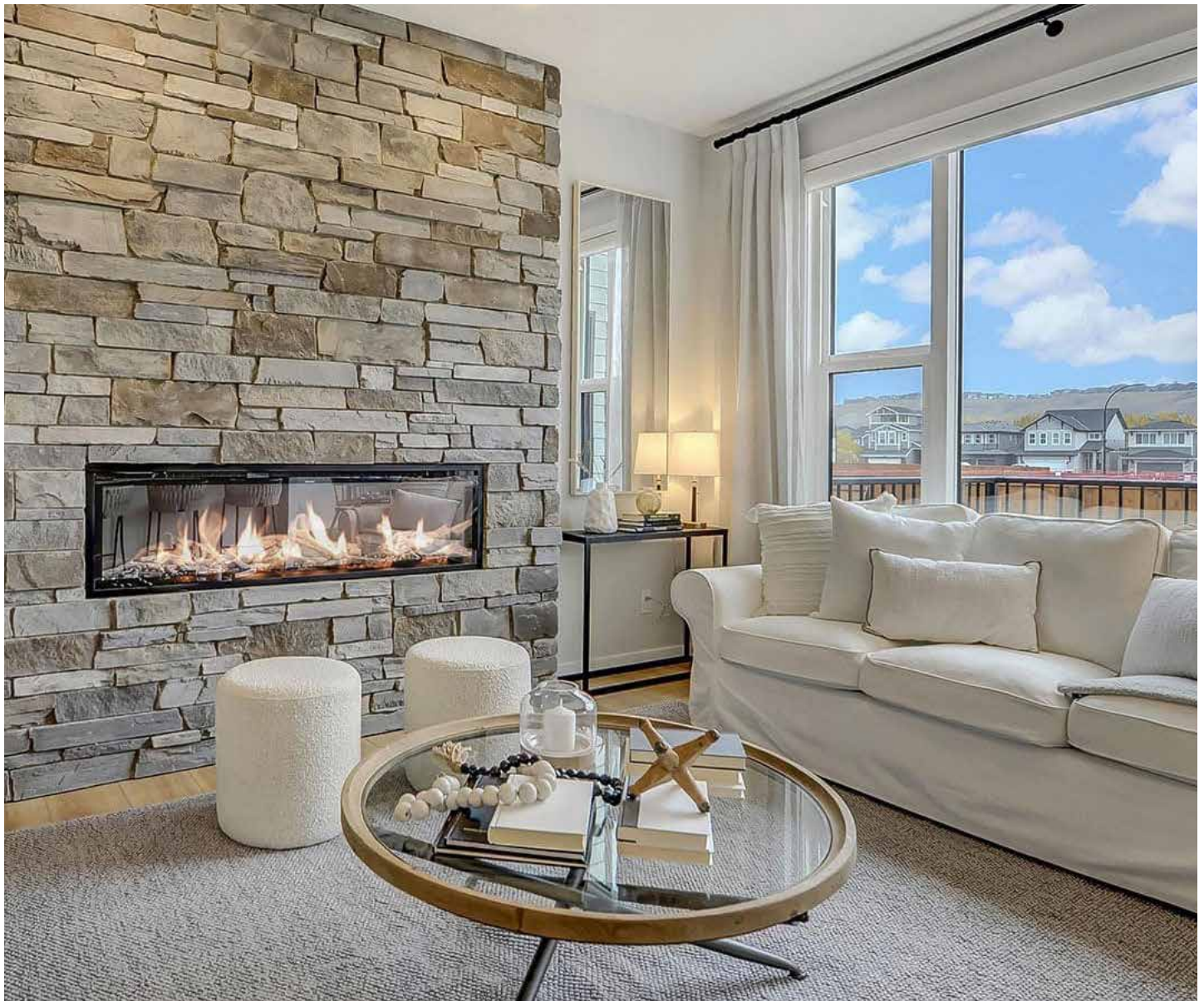
Country Cliffstone - Granite Ridge