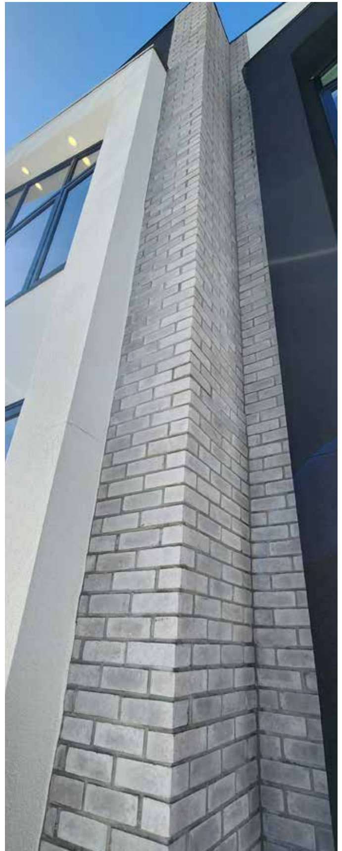
Contemporary Brick - Bisque