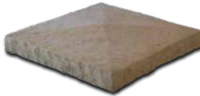
Peaked Capstone ~ 28" X 28" Also available in 22" X 22" or 24" X 24"