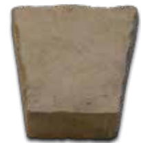
Keystone ~ 10" Tall