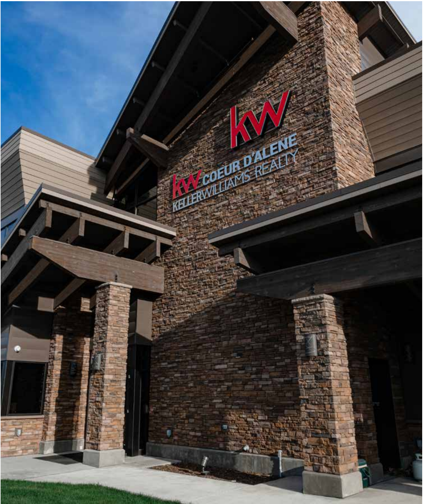
Mountain Ledge - Durango Brown