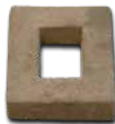
Electrical Box Trim Single Outlet