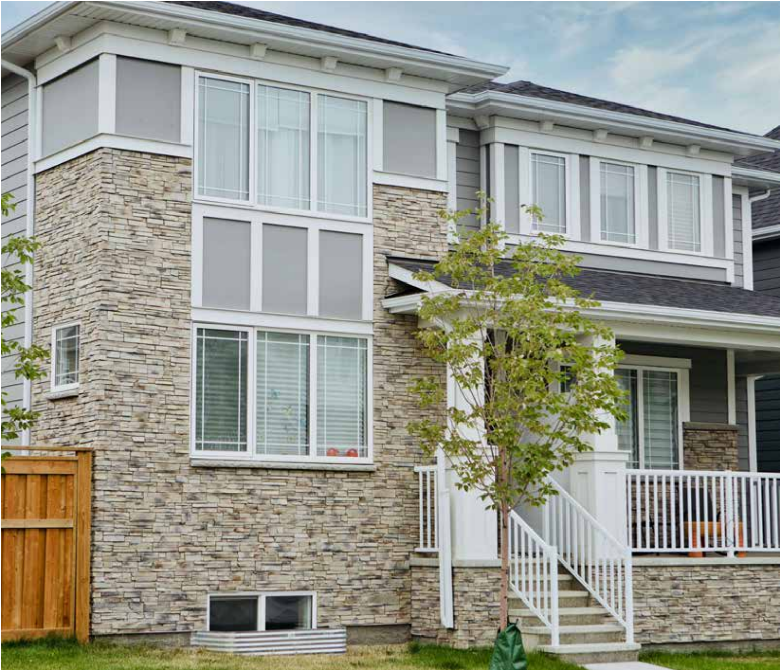
Northern LedgeStone - Alpine