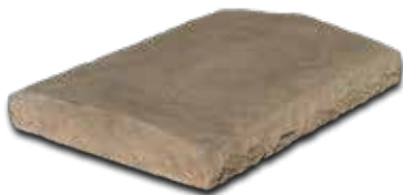
Beveled Wall Cap ~ 14" X 20" Also available in 12" X 20"