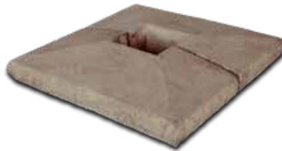
Split Cap 22" X 22" (with 6.5" knockout)