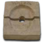
Water Faucet Trim