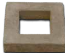
Electrical Box Trim Double Outlet