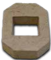
Light Box Trim