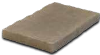
Hearthstone ~ 12" X 20" X 2"