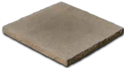
Hearthstone ~ 20" X 20" X 2" Also available in 24" X 24"