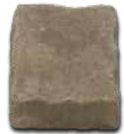
Trimstone ~ 6" X 8"